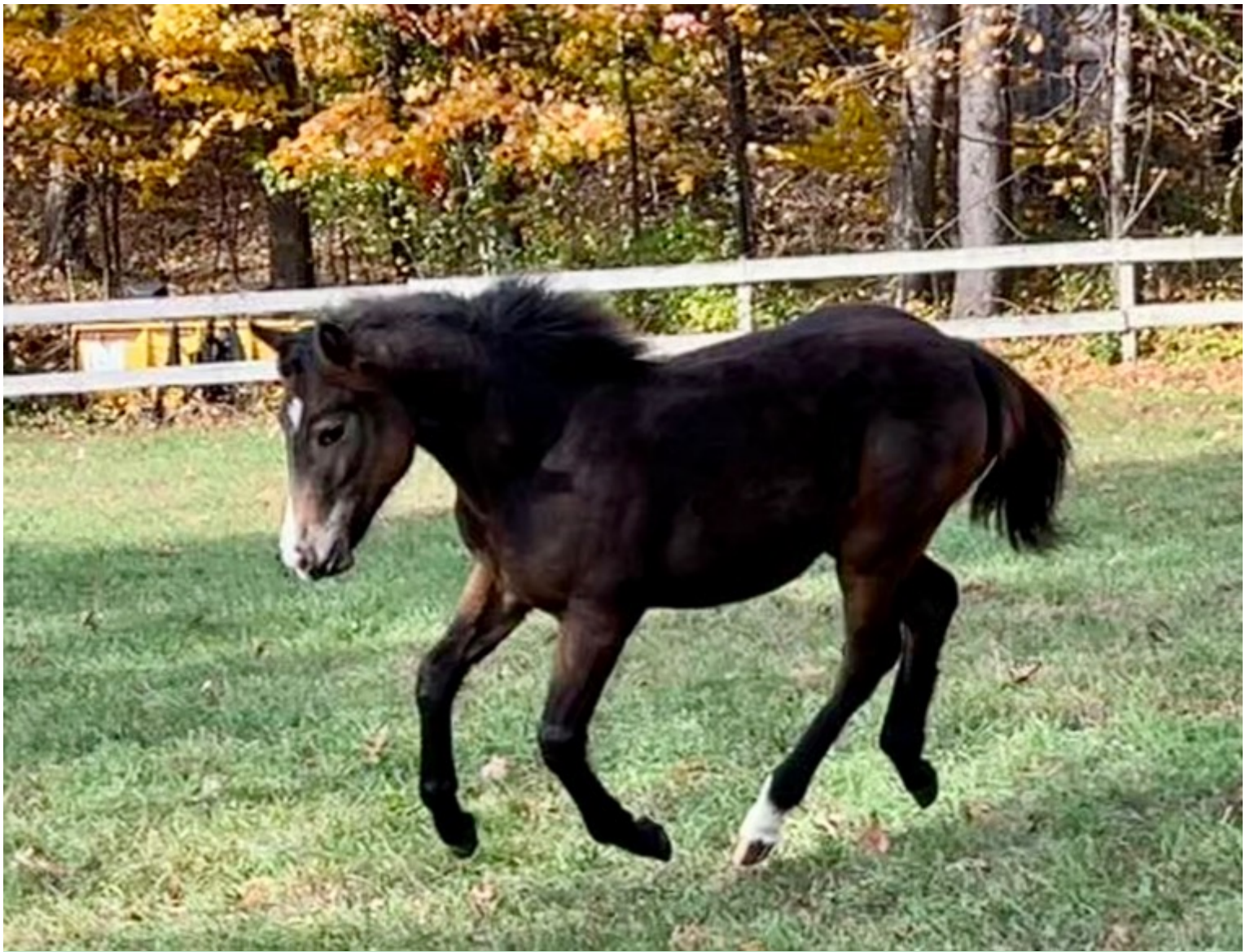
Trout Ranch Moxi (Trout Ranch Malarkey x New Song's Autumn)