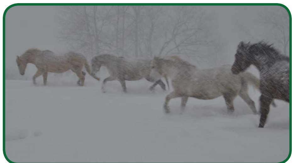
Brynn (QH), Wildwych Belladonna, *Grey Pearl and Wildwych Giselle enjoying Winter Storm Stella at Catskill Connemaras. (March 2017)