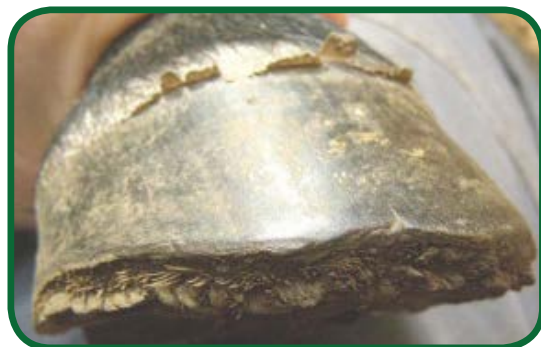
Above photos are of an HWSD/HWSD affected pony.